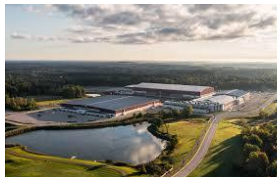
SPIRE Institute 5201 SPIRE Circle, Geneva Ohio 44041

We are just a few days away from the best and most exciting weekend of the year! We are so excited that we have so many teams and individuals joining us this year. Enclosed is much of the information you will need to make your weekend run as smoothly as possible.