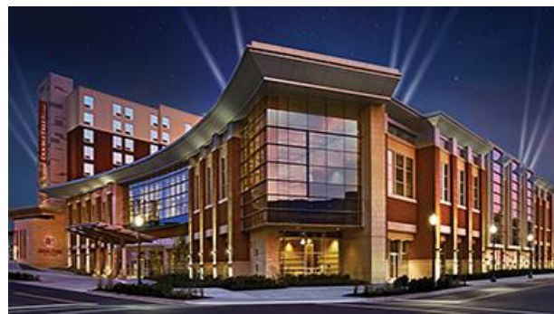
Lawrenceburg Event Center 91 Walnut Street - Lawrenceburg, Indiana 47025

We are just a few weeks away from the best and most exciting weekend of the year! We are so excited that we have so many teams and individuals joining us this year. Enclosed is much of the information you will need to make your weekend run as smoothly as possible.